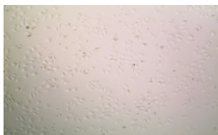
Figure 3. Viability of PathHunter eXpress cells were confirmed by bright field microscopy.